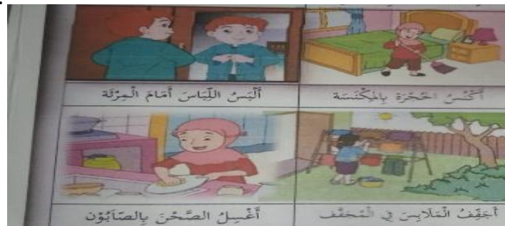
Figure 3: Gender Subordination

Gender subordination refers to placing in a lower class, rank, or position. In this case, placing women in a lower position is called subordination. The form of subordination is found in chapter 3, pages 37 and 38 about vocabulary and sentences, and page 41 about conversation. On page 37, you can see the role of women washing dishes while men are getting dressed in blue clothes to go to office work. When wearing clothes, he is in front of the mirror so that his reflection appears. Not only that but women are also subordinated to the job of sweeping bedrooms and drying clothes in the yard. This means that men are in a higher position because they have office jobs, while women's work is household work. This can be observed in the following Figure (3).