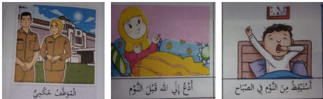
Figure 1: Illustration of single male and female, as well as boy and girl

Before discussing gender representation in Arabic textbooks, the findings of this study describe forms of gender representation in Arabic textbooks for grade VIII Islamic Boarding School Ummusshabri Kendari through the percentage of the use of people's names in a conversation, the percentage of the use of illustrations of single male and single female images and the number of male and female images in a group in the vocabulary. In this case, the study's findings showcased that the number of illustrations of people in the textbook reaches 113 data. Sixty-one data represent male images, while 23 data represent female images. The other 29 data represent images of men and women in the same group. In terms of percentage, the number of male image data reached 53.9%, the total female image data reached 20.3%, and the number of male and female images simultaneously reached 25.6%. An example of the visual data can be observed in Figure (1).