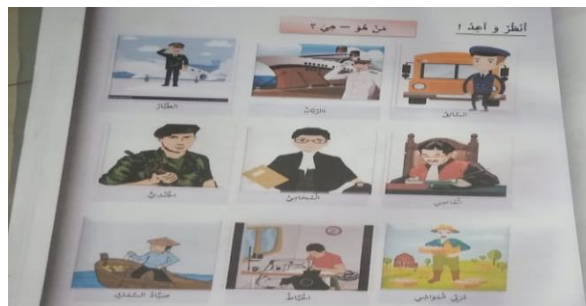
Figure (6): Gender Marginalization

The marginalization of women's participation in public space in Figure (5) is an example of gender marginalization. A woman's only public sector job in Figure (5) is teaching. A female instructor is shown instructing in front of her students [the first image on the left]. The female teacher attempted to clarify the concepts her students did not understand with a stick. It is implied that men predominate in occupations such as cooking, selling vegetables, medicine, law enforcement, sweeping, sports, and engineering, all of which are public positions. In actuality, women have access to all jobs. Another illustration is shown in Figure (6).