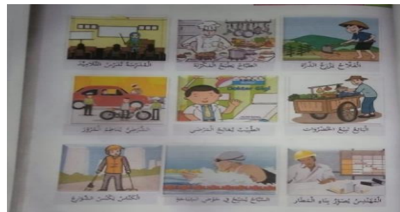
Figure 5: Gender Marginalization

Marginalization refers to the process of marginalizing roles due to gender, which limits access, services, existence, policies, and participation in social life. In this Arabic language textbook, women's gender marginalization is an example of Figure 5.