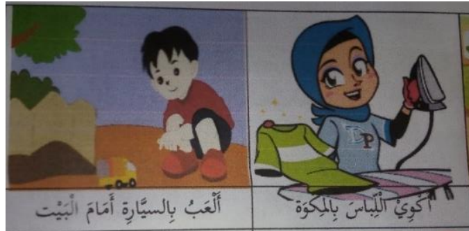
Figure 4: Gender Subordination

Additionally, figure (4) supports the claim made in the preceding paragraph that men handle matters outside the home while women are responsible for taking care of the household. In other words, ladies iron their clothes while males play with toy cars outside the house. The ensuing figure illustrates this.